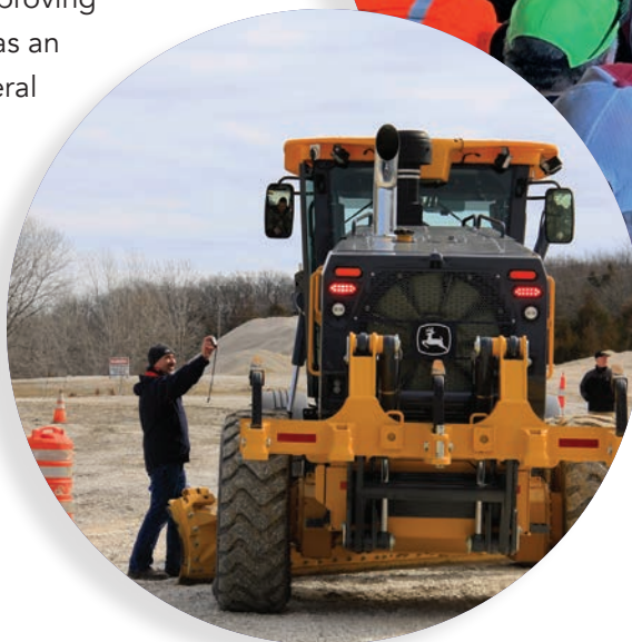
Bottom Left: Participants competed in an equipment challenges and skills building event organized by Great River Engineering.